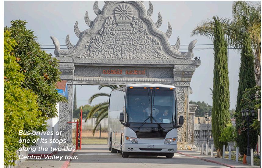
Bus arrives at one of its stops along the two-day Central Valley tour.