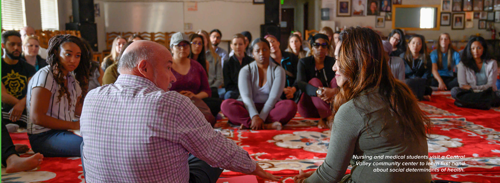
Nursing and medical students visit a Central Valley community center to learn first-hand about social determinants of health.