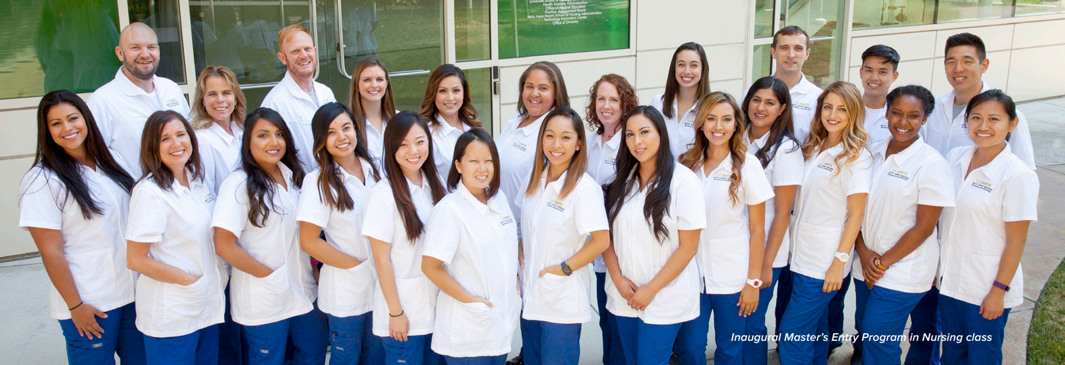
Inaugural Master's Entry Program in Nursing class