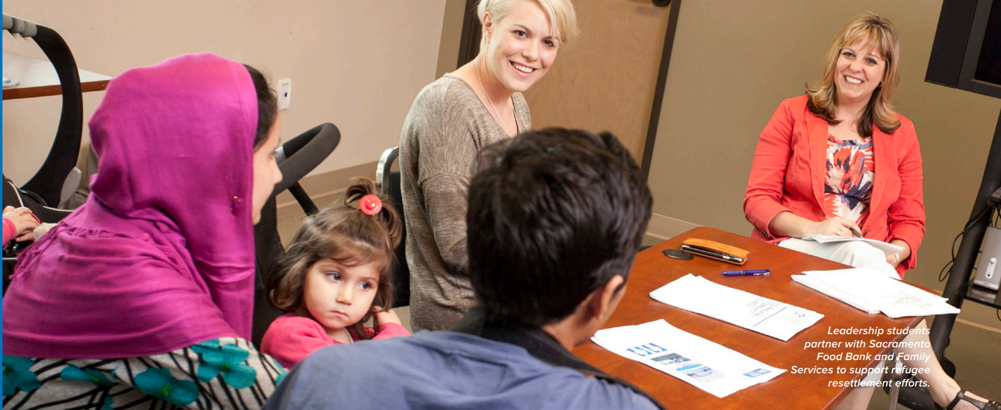
Leadership students partner with Sacramento Food Bank and Family Services to support refugee resettlement efforts.