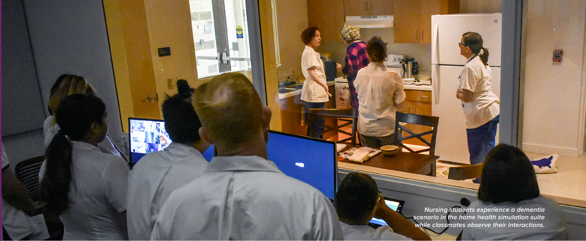
Nursing students experience a dementia scenario in the home health simulation suite while classmates observe their interactions.