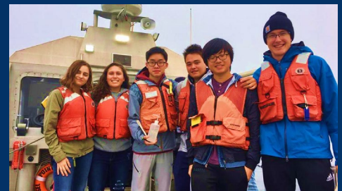
From the Equine Center to Bodega Marine Lab, our pre-college programs bring high school students into active learning environments built on signature UC Davis fields of study.